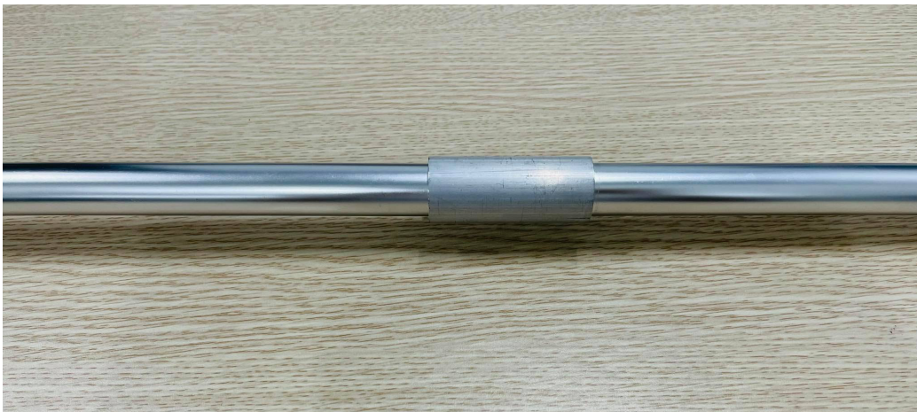
Picture 5: Sensor tube extenders installed completely and wait at least 30 minutes before install to the tank