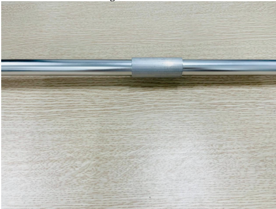
Picture 5: Sensor extender tubes installed completely and wait at least 30 minutes before install to the tank